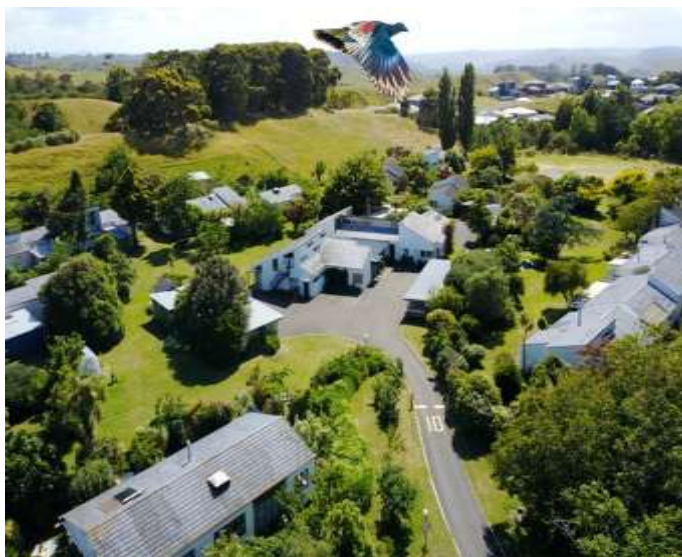
The Settlement from above

GETTING HERE Virginia Road joins the main road to New Plymouth (SH3) about 1.5 km past